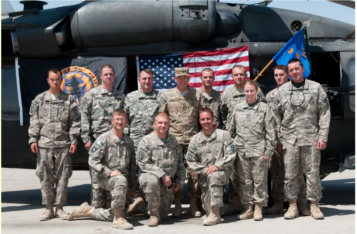
C Company photo with COMISAF General Petraeus on 4 July